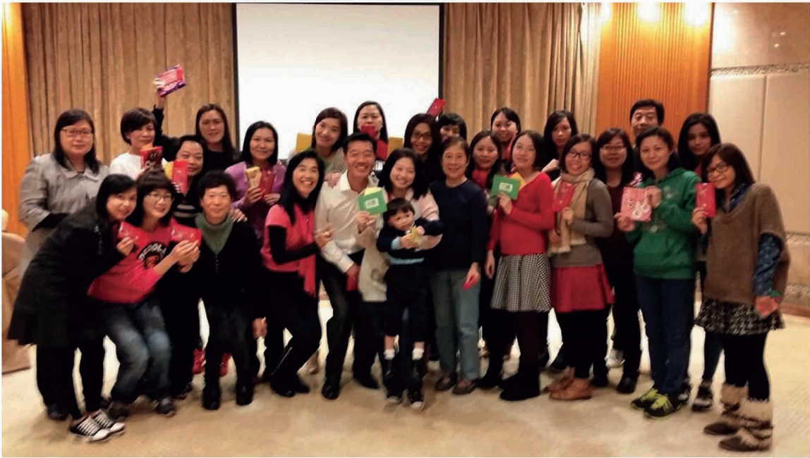
Our HongKong Head Office 2 Sung Ping Street, 1003-4 Hilder Centre, Hunghom, HongKong Tel : 852-23346837 Email : info@sunnycreations.com.hk