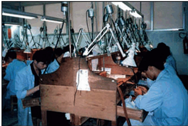
Our China Factory 4F, C, Kam Shun Ind. Mansion, TaiLuTong, Panyu, China